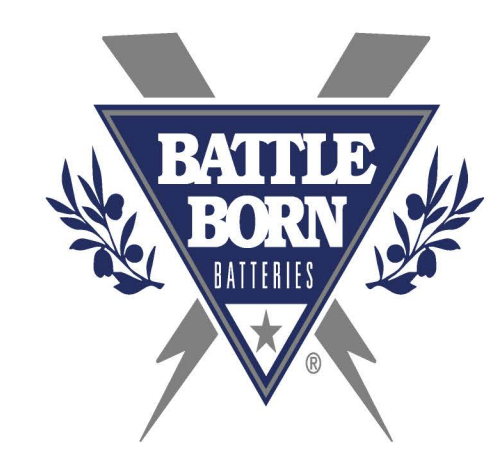
Don't change the aspect ratio, stretch, or squeeze.