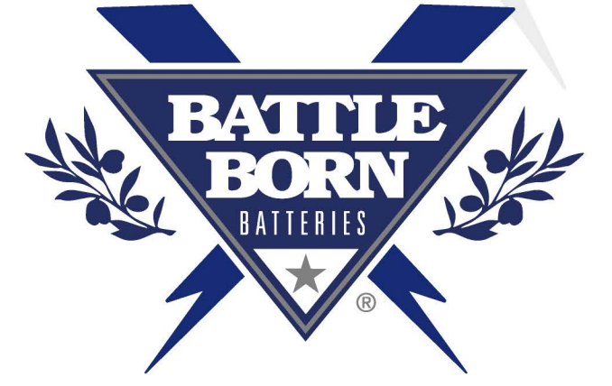
Don't change the colors.