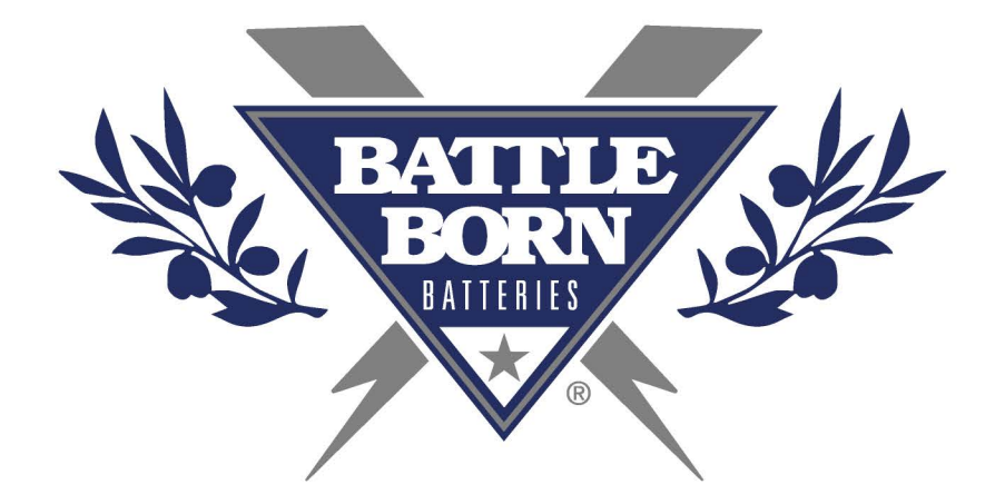
Don't alter proportions of the word mark or icon.